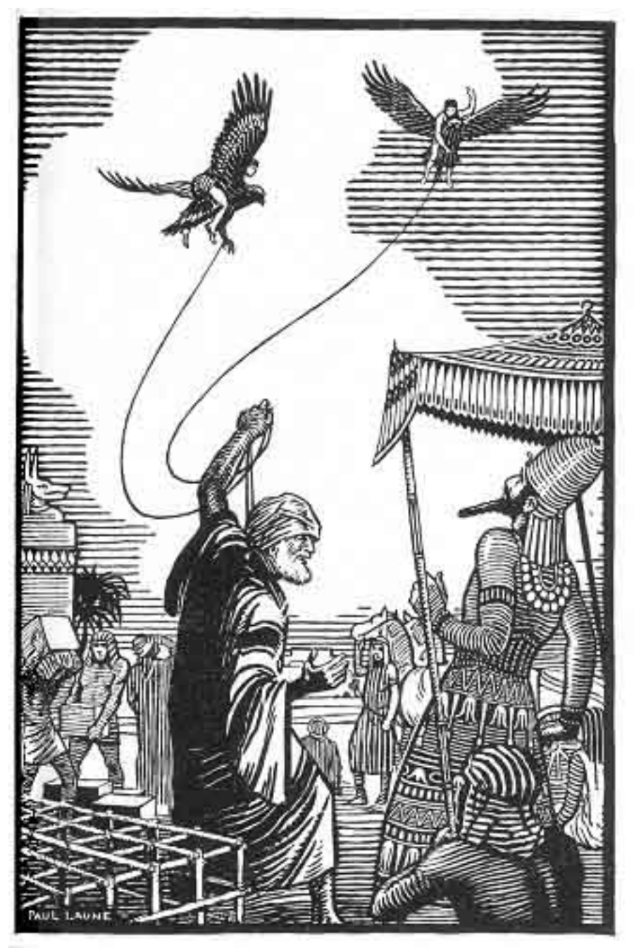
AHIKAR ANSWERS PHARAOH'S RIDDLE